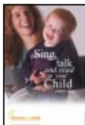
6 - Sing, Talk