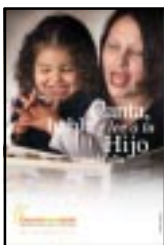
7 - Sing, Talk (Spanish)