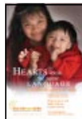
4 - Hearts Speak