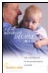
1 - Advanced Degree

Posters are available while supply lasts at no cost for agencies within Lane County. Outside of Lane County there is a minimal charge of $2.00 per poster plus a $3.25 shipping charge for every 7 posters ordered.