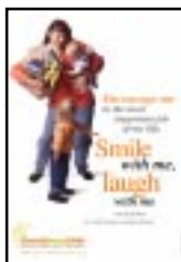
2 - Grocery