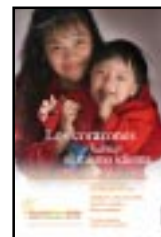
5 - Hearts Speak (Spanish)